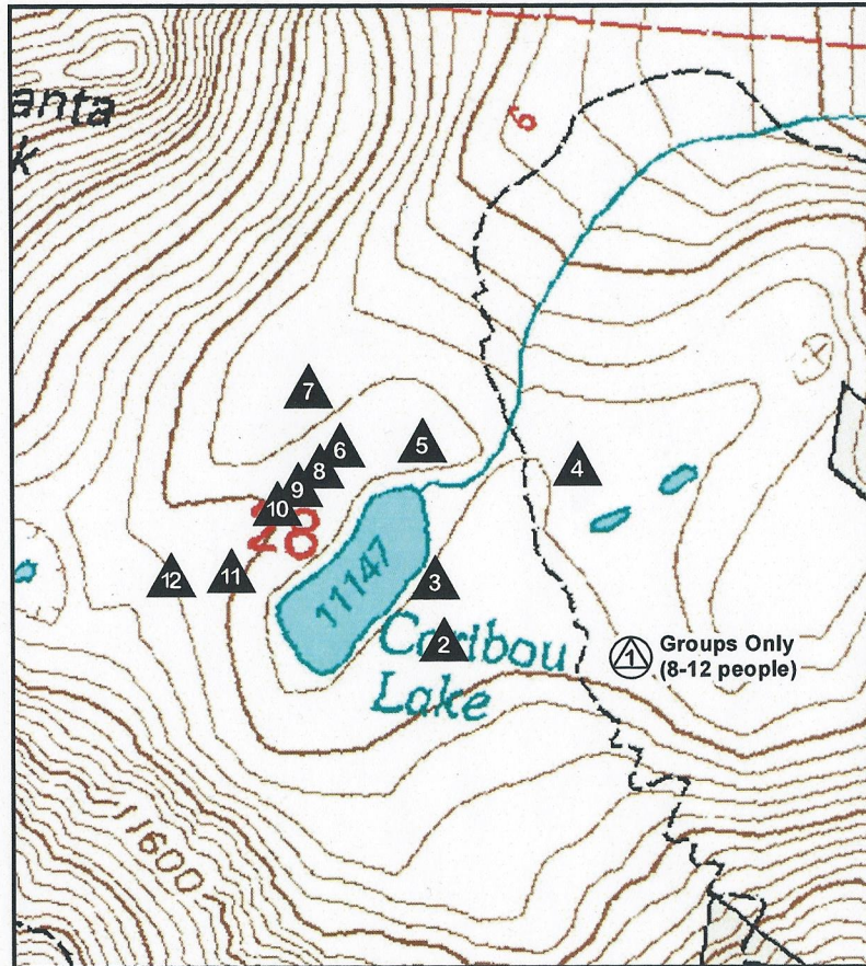
Caribou Lake Travel Zone