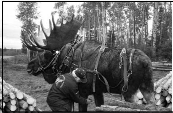
Don't try this at home!

Then we went on a search and destroy mission along the banks of the river. We ferreted out ox-eye daisys and chamomiles- bagged them and dragged them. Ranger Summerlin pointed out a rare orchard hidden in the river wetlands. It was a beautiful and productive morning. The rangers commented that there used to be many many more whites (daisys and chamomiles) but thanks to previous years' efforts, they are about 95% eradicated. Next year we plan to set a date before the spring meeting so that more people can mark their calendars and sign up for a day spent conquering the terrorist weeds and admiring the beautiful wildflowers.