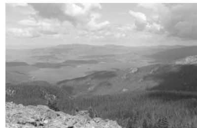
Lake Granby from Mt. Irving Hale